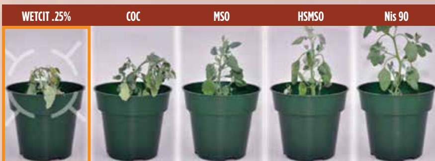
Lamb's quarters treated with Roundup PowerMAX®